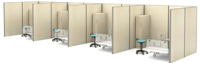
Option B: 8ft x 8ft 4-Pack List: $34,074