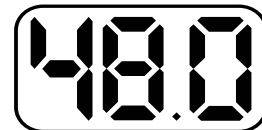
Standing task work