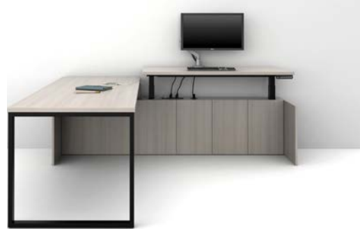
Cantilevered Height Adjustable Table and Run-Off