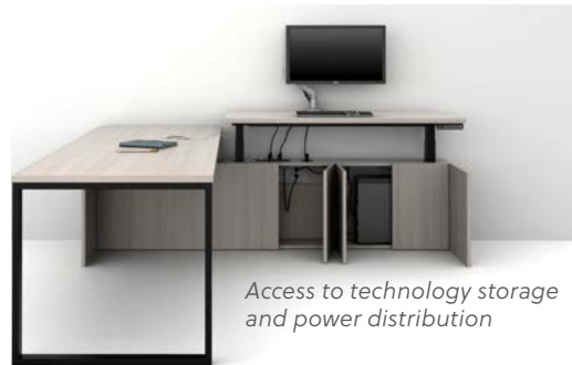
Access to technology storage and power distribution