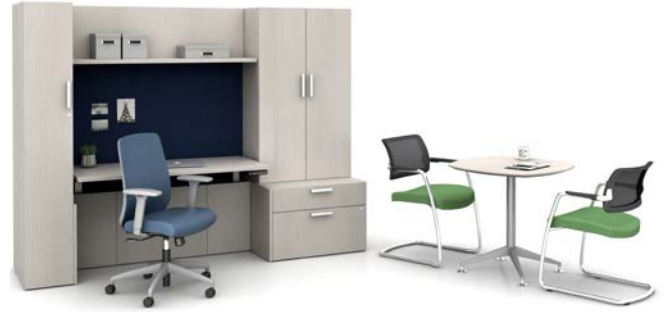
Cantilevered Height Adjustable Table incorporated into a private office

The Calibrate Cantilevered Height Adjustable Table takes private offices to new heights. Easily integrate as a primary or secondary worksurface while ensuring optimal comfort and health with this sit-to-stand option. The Cantilevered Height Adjustable Table refines the aesthetics of height adjustability and blends effortlessly into the overall look while supporting various work postures throughout the day.