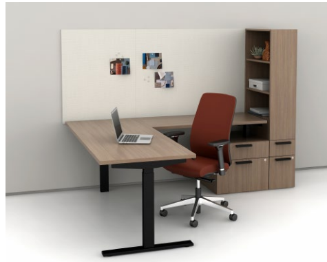
Calibrate Office with Height Adjustable Table integrated into Box-File Height Adjustable Table Base.