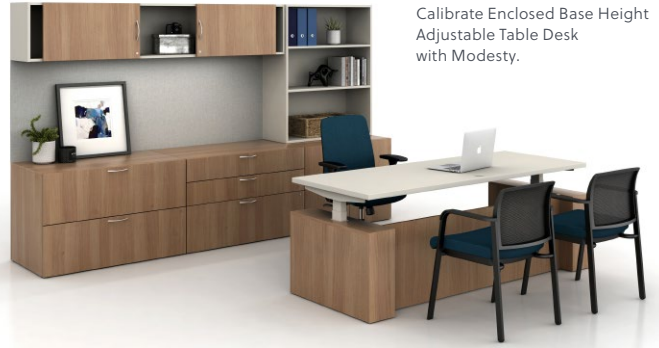
Calibrate Enclosed Base Height Adjustable Table Desk with Modesty.