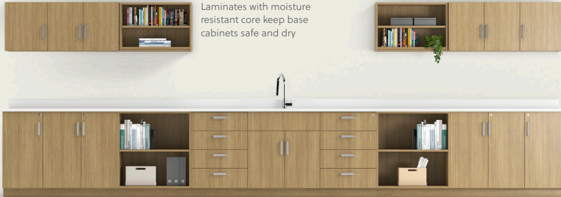
Laminates with moisture resistant core keep base cabinets safe and dry

Enjoy the convenience of having the printer nearby