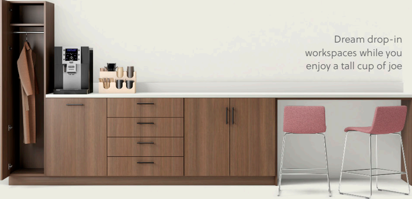
Dream drop-in workspaces while you enjoy a tall cup of joe

Keep your items close by with tall cabinet wardrobes