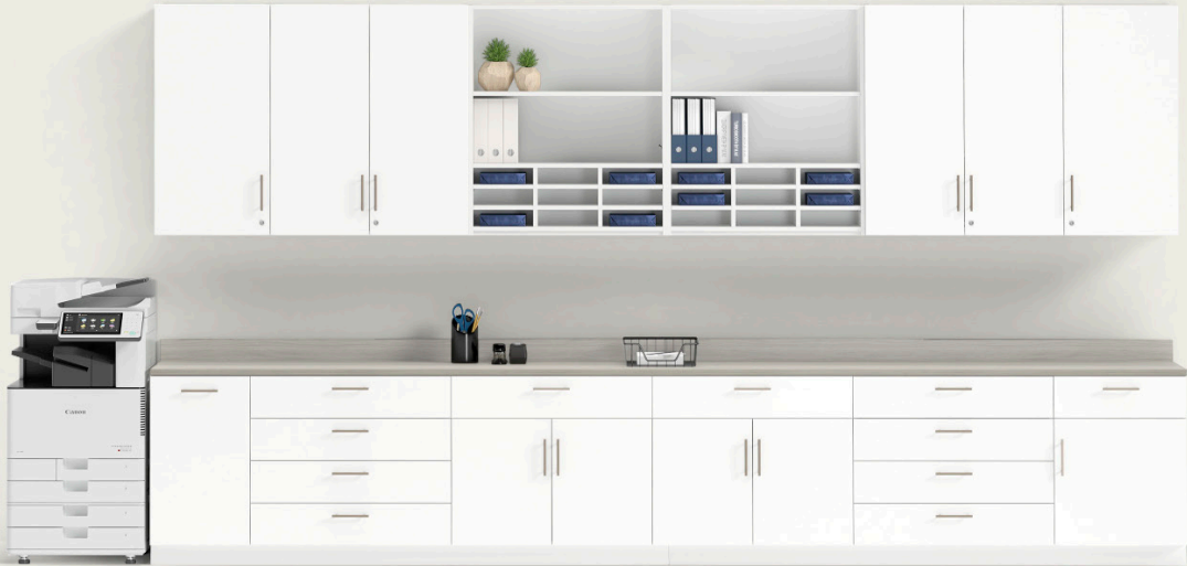
Storage options that keep things neat and tidy with room to spare