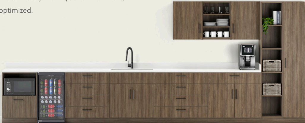
Your appliances fit right in no matter the size thanks to 1" width increments on all CaseWorks cabinets

From compact configurations to large-scale setups, each CaseWorks application is customized to work seamlessly within your environment, ensuring every inch of space is optimized.