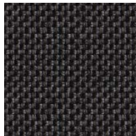
Chelsea Black seat upholstery