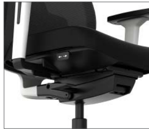
Slim profile synchro-tilt mechanism.