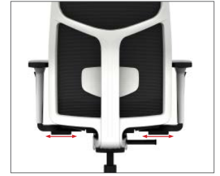
3D arms with 1.4" of arm width adjustment on each side.