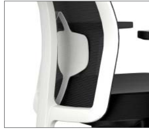
Adjustable lumbar with 2.4" of height adjustment.

"I designed Chelsea with the aim of making a chair that appears light, fresh, young and likeable. My goal was to create a product of innovative simplicity that shows how comfortable it is. The central element is the flexible lumbar support, which is almost completely covered by the back frame."