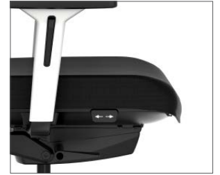
Waterfall edge seat for all day long comfort.