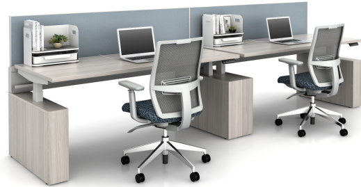
PowerBench one-sided application