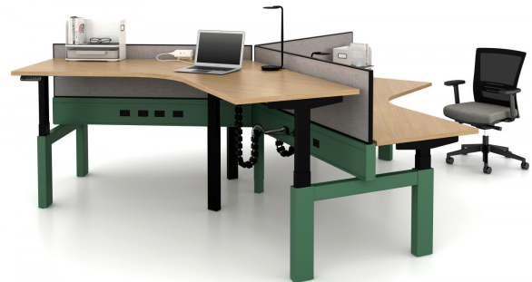
Also available with H-Leg Base