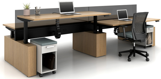
PowerBench two-sided application

Encounter PowerBench evolves our popular PowerBeam product, adding ergonomics to the proven power platform. PowerBench optimizes space while fostering collaboration among employees thanks to its simple, succinct kit of parts. Its laminate, enclosed laminate base conceals the height-adjustable legs, creating an upscale and quiet design. PowerBench provides a feeling of permanence, offering users a strong sense of place in an ever-changing workplace.