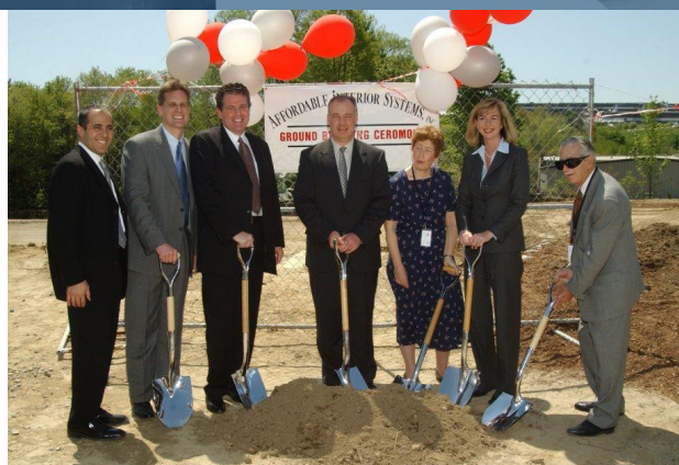
2003: AIS groundbreaking ceremony in Hudson, MA.

While office furniture is what we make, serving and supporting our dealers is really at the heart of what we do. From customer service and design, to specials, project management, and engineering, we're dedicated to ensuring our dealers are successful year after year.