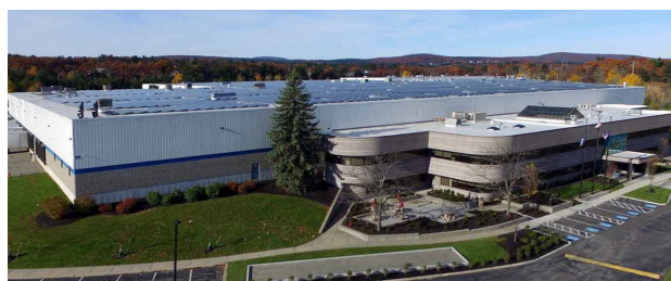
Leominster, MA headquarters.