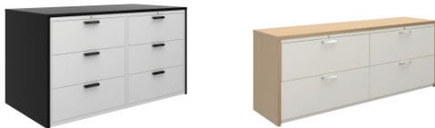
Above: L Series lateral files wrapped in standard AIS laminates. (L Pull painted black above, left.)