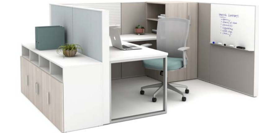
Calibrate storage can be specified to perfectly align with Matrix heights.