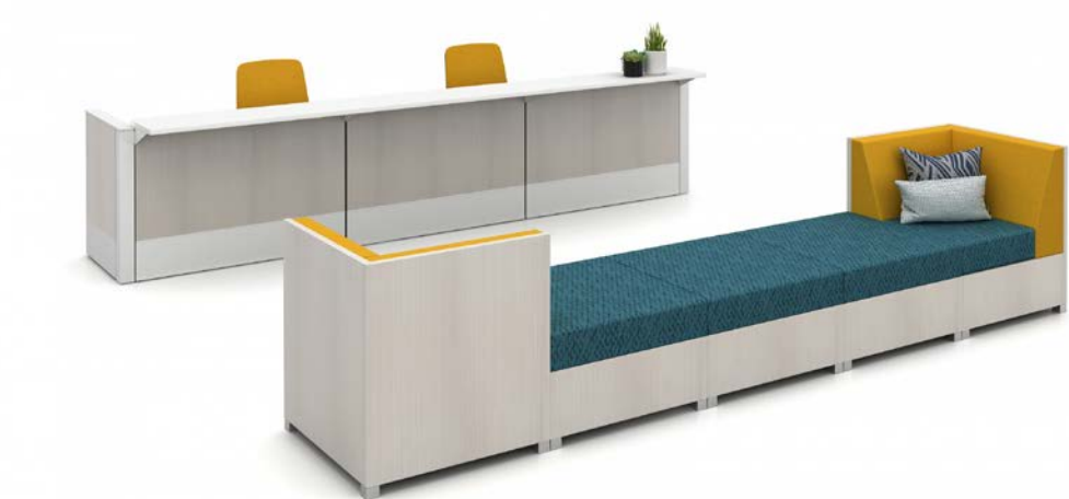
Design a reception station with Matrix, and coordinate materials across the company.