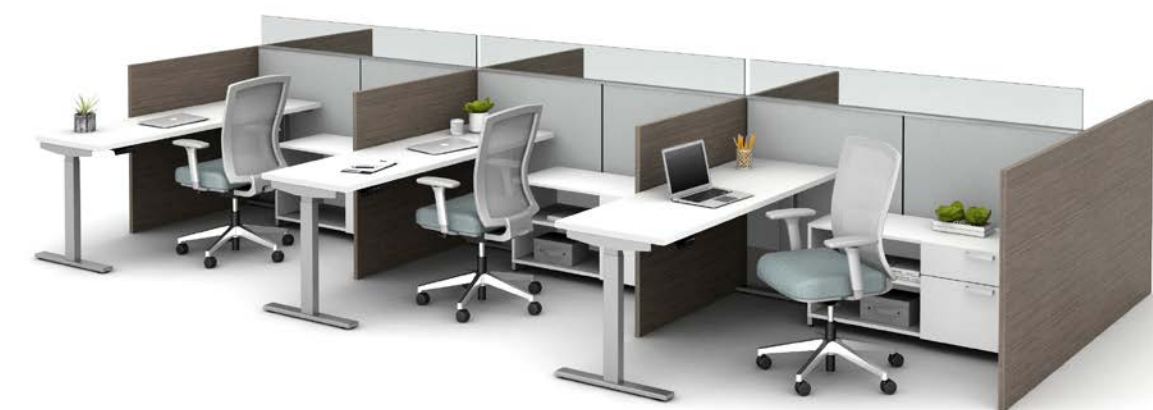
Laminate Gallery Panels bring levity to space and enhance design options.