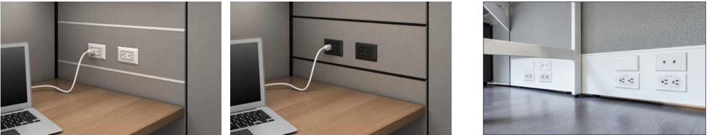
Matrix power above the worksurface can be specified in white or black finish.