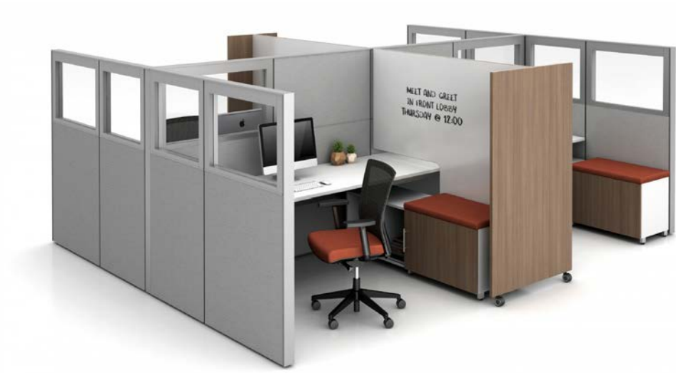
Design with glass tiles to support daylight and views for users.