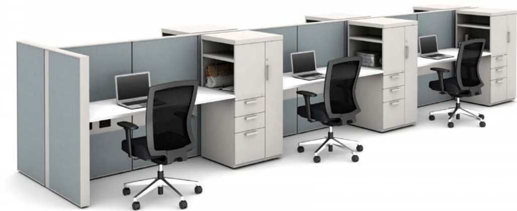
Storage towers easily divide space while ensuring users have personal filing and storage needs met.

Matrix serves a world of purposes, but don't take our word for it. Take a look at some of our favorite configurations. Then go dream up one of your own.