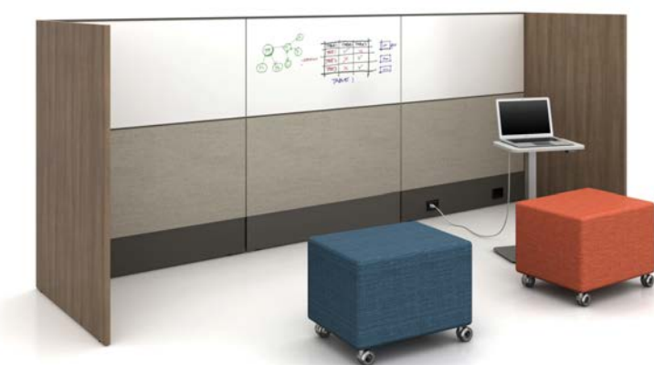
Matrix with Gallery Panels conveniently create collaborative spaces in the open plan.