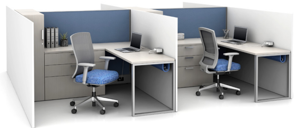
Divi workstations with PET Undersurface Wire Managers

Need more privacy? Select from a variety of PET Privacy Enclosures including L- and U-wrap which incorporate wire management into the design.