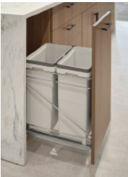
Pull-out trash bin