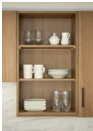
3 shelf wall cabinet