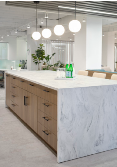
Custom Corian island wrap