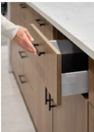
Soft close drawers