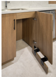
ADA compliant options