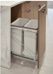
Pull-out trash bin