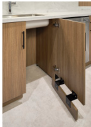
ADA compliant options