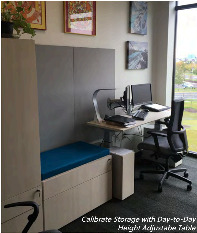
Calibrate Storage with Day-to-Day Height Adjustable Table