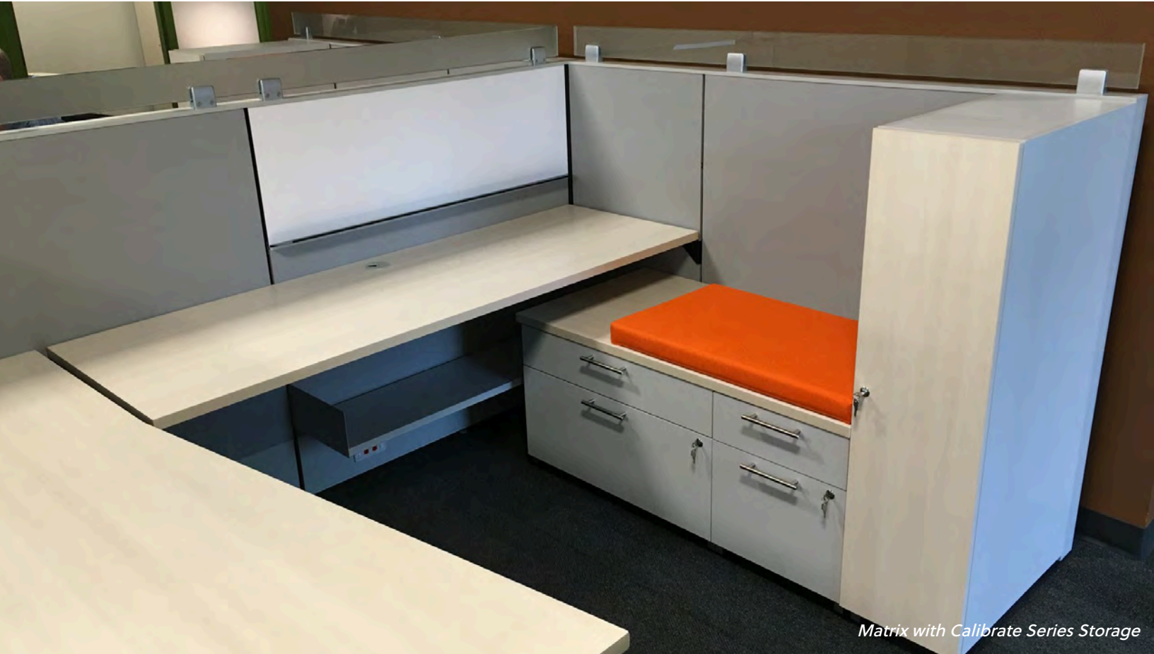
Matrix with Calibrate Series Storage