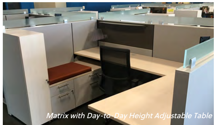
Matrix with Day-to-Day Height Adjustable Table

For additional images: http://imagelibrary.ais-inc.com/